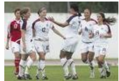
USA Women's Soccer Team